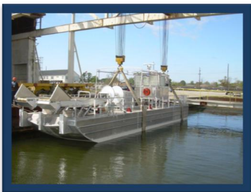
MSRC MKII VSMSS

Corporation 100' (30.48m) RAstar 3100 Class Terminal Support/Escort Tugs. In 2011, TY Offshore delivered a 57' (17.37m) MKII Very Shallow Draft Multi-System Skimmer (VSMSS) for Marine Spill Response Corporation (MSRC). Six (6) of a total order of ten (10) 90' (27m) MK V patrol boats are also under construction, four (4) having already been delivered.