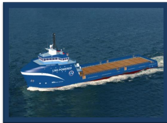
Harvey Gulf International Dual Fuel Supply Vessel

Showing its diversity, TY Offshore is currently building four (4) Harvey Gulf International 302' x 64' (92m x 19.5m) Dual Fuel Supply Vessels and ten (10) 30,000 Barrel 297'6" x 54' x 12' (16.45m x 3.65m) Fuel Barges for FMT. In early 2012, TY Offshore delivered two (2) Signet Maritime